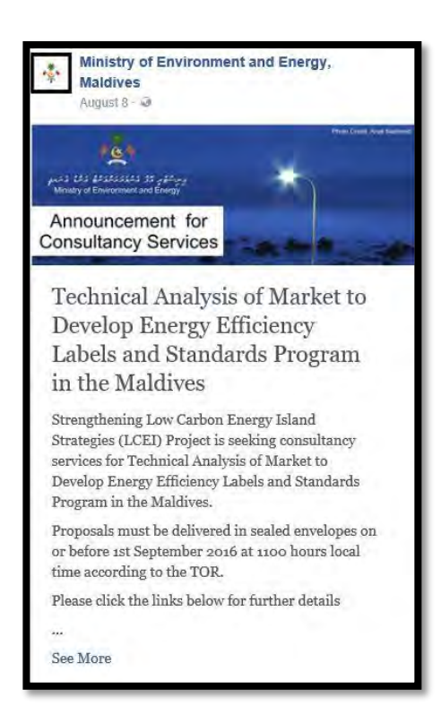
08th August 2016 - Link: https://goo.gl/jwSvtu