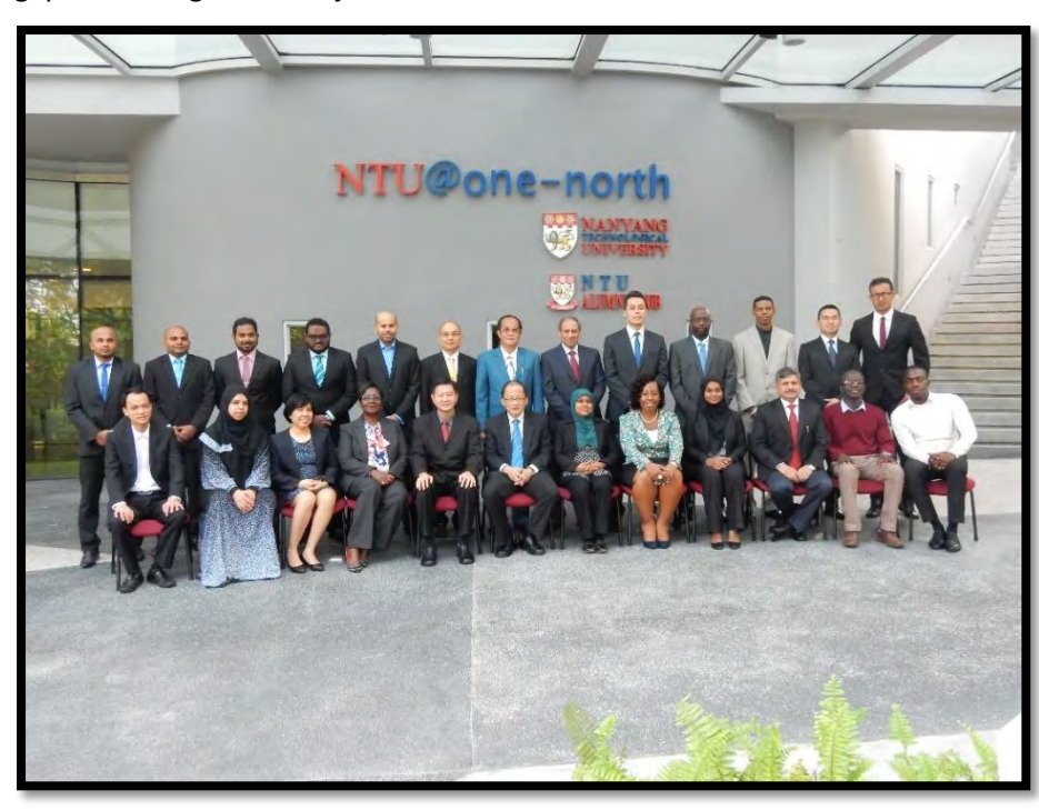
Training session in Singapore cooperation programme

The participants of the training were provided information about challenges in technological integration, project financing, and carbon tax/trading as well as multilateral collaborative opportunities for mitigating the impact of climate change and other environmental concerns.