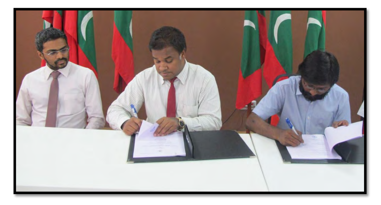
Contract signing to develop energy efficiency awareness video spots

These video spots will be used in several media platforms to increase the awareness on energy efficiency.