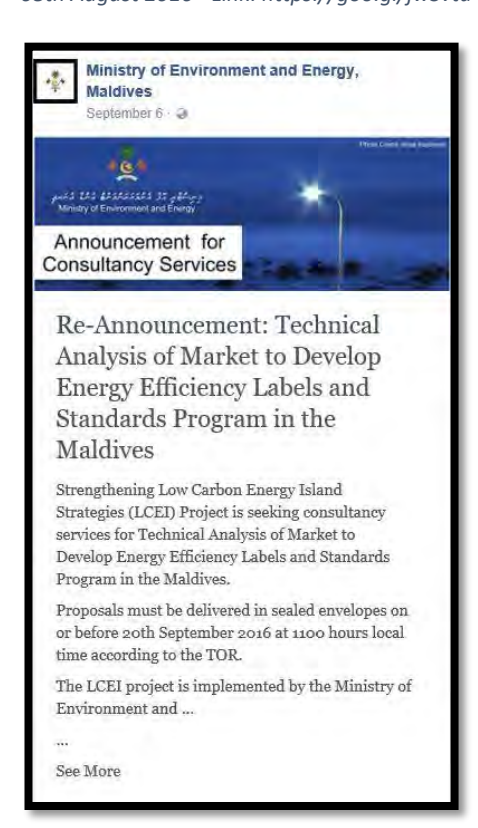
6th September 2016 - Link: https://goo.gl/4EEoT4