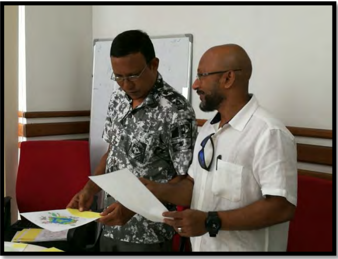
Energy Efficiency Art Competition judging