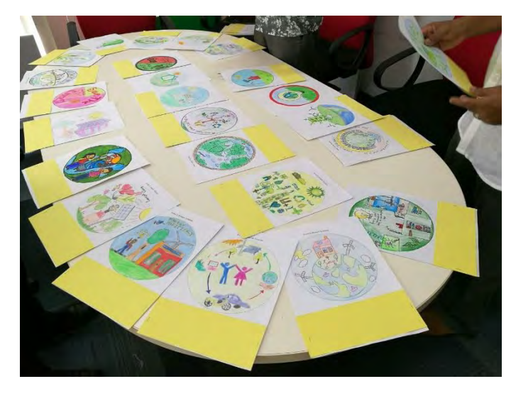
Energy Efficiency Art Competition judging

22<sup>nd</sup> August 2016 - The judging of "Energy Efficiency Art Competition 2016" was held on 22 August. The judging panel included the representatives from United Artists of Maldives (UAM) and Ministry of Environment and Energy.