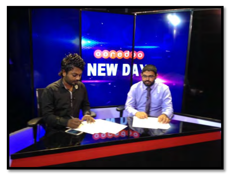
Providing information on Ooredoo Newday program of Dhifm about the deadline extension of Energy Efficiency Art Competition

9<sup>th</sup> July 2016 - The deadline for art work submission of "Energy Efficiency Art Competition" was extended to 12:00 pm of 19th July 2016. The original deadline was 4<sup>th</sup> July 2016. It was extended due to the request from many schools, especially the schools in islands.