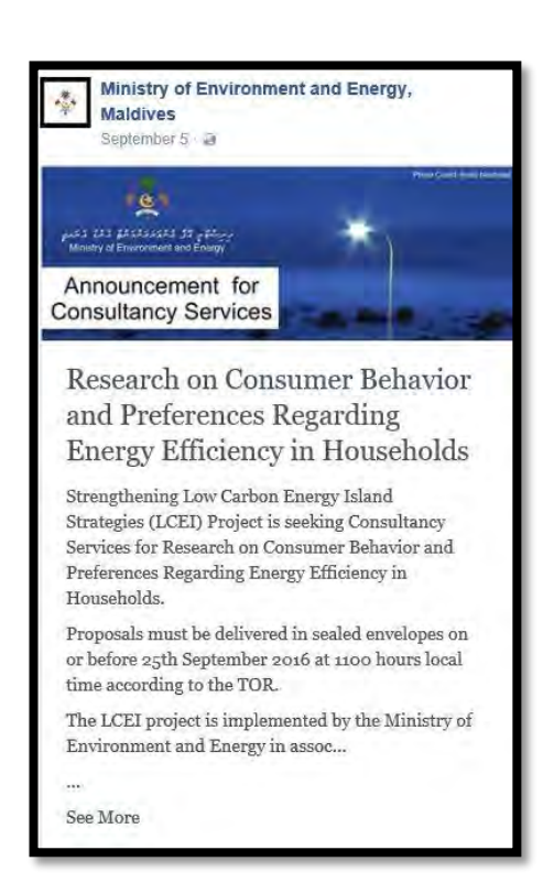
5th September 2016 - Link: https://goo.gl/EKd3Pj