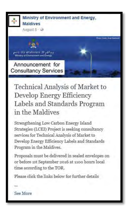
08th August 2016 - Link: https://goo.gl/jwSvtu