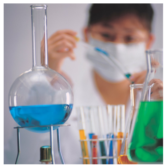
The final session consisted of a brainstorming to develop ideas for possible future work of the OECD/UNEP Global PFC Group. The following ideas were discussed:

Governments of Russia, the US and Germany presented on their PFC programmes and/or the results of their investigations into the fate of PFCs in the environment and measured in humans. Australia presented the results of the 2009 OECD PFC Survey. A representative from the FluoroCouncil presented the work being done by its members in addressing PFC issues. All power point presentations are available in the following link: www.oecd.org/ehs/pfc.