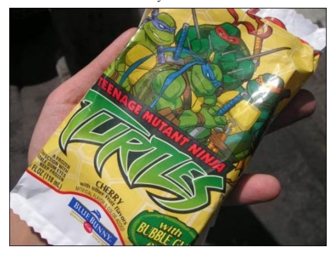
How can I reduce my exposure?

Avoid purchasing or, at a minimum, limit use of products containing PFCs.