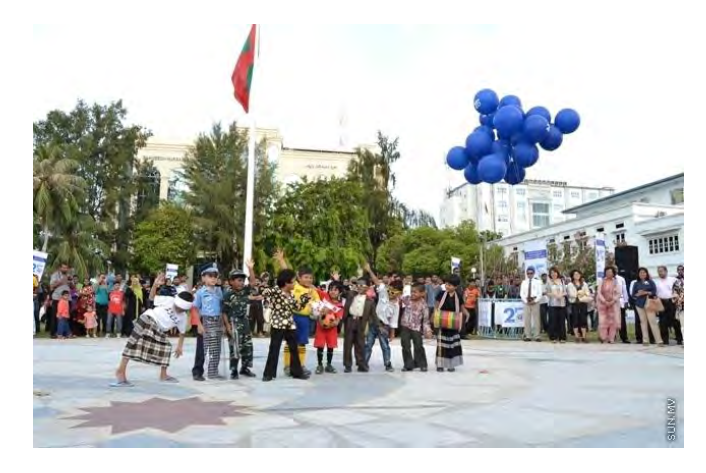
18 September 2012

World Ozone Day activities to mark the 25th anniversary of the Montreal Protocol on Substances that Deplete the Ozone Layer was held in Male' 16th September 2012. A children's evening was celebrated in Republic Square, and 25 students selected by the Swimming Association of Maldives swam from Male' Atoll Funadhoo to Male' carrying balloons with the Ozone Day theme.