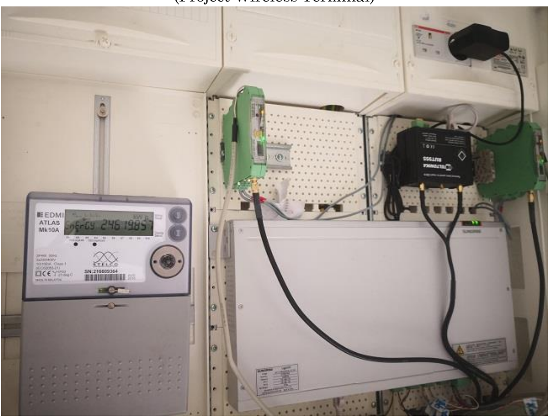
(Metering Device and Data Logger)