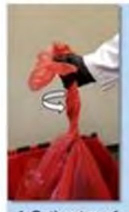
1. Gather top of bag and twist