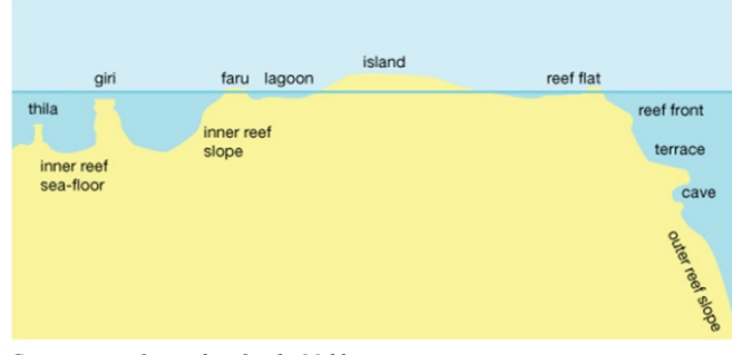
Cross section of a coral reef in the Maldives

The coral reef systems of the Republic of Maldives are the eighth largest in the World and cover an area of approximately 4513 km2. Due to the very low total area of land, coral reefs are the dominant ecosystem found in this chain of atoll islands. Present living reef system of the Maldives is 8,000 to 10,000 years old.