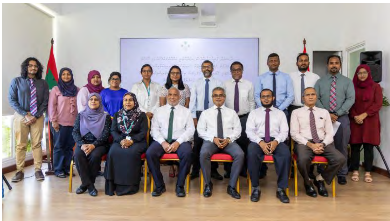
Figure 2 Group photo taken following the MoU signing ceremony on 6th November 2024, with officials from the Ministry of Tourism and Environment (MOTE), Maldives Bureau of Statistics (MBS), and the Utility Regulatory Authority (URA).