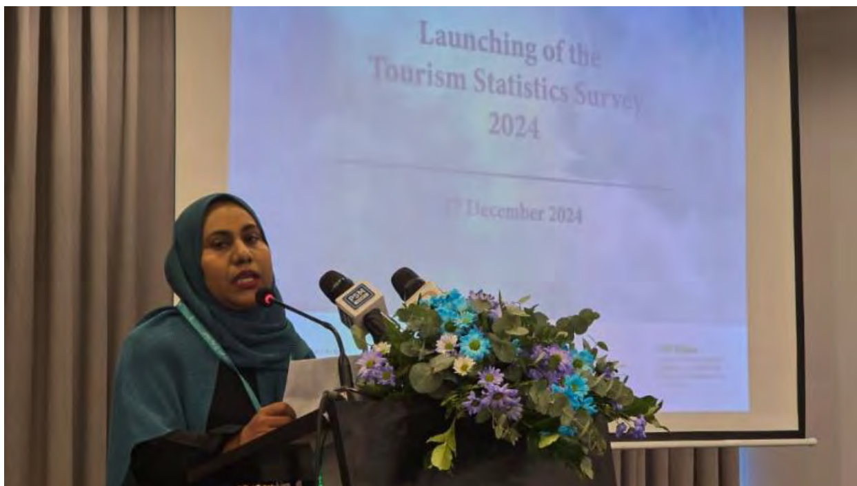
Figure 4 Ms. Aishath Hassan, Chief Statistician of the Maldives Bureau of Statistics (MBS), addressing participants during the launch ceremony of the Tourism Statistics Survey 2024, on 17th December 2024.