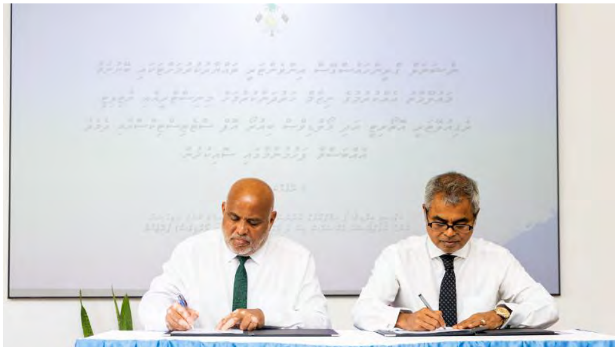
Figure 1 The MOU was signed by Minister of Tourism and Environment (MOTE), H.E Thoriq Ibrahim, on behalf of MOTE and the Utility Regulatory Authority, and Dr. Ali Haidar Ahmed, Minister of Housing, Land, and Urban Development, on behalf of the Maldives Bureau of Statistics 1

Following the signing of the MoU, the CBIT Maldives Project supported the implementation of the necessary changes to the MBS Resorts Survey, including technical revisions to the form and enhancements to the online survey platform.