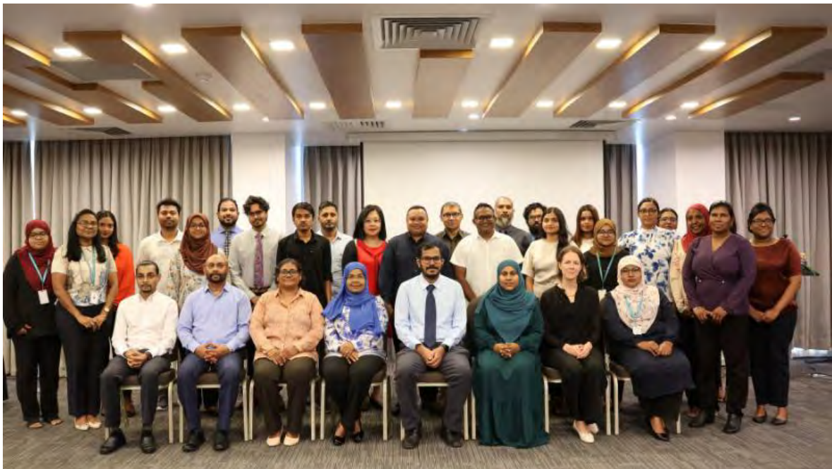
Figure 5 Group photo of participants at the Dissemination Workshop on the updated Tourism Statistics Survey 2024, held on 17th December 2025, with attendees from tourism establishments, government agencies, and industry associations.