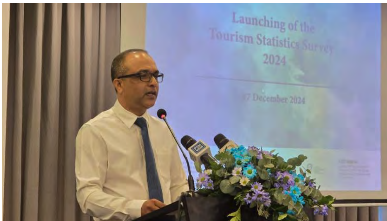
Figure 3 Dr. Muaviyath Mohamed, Minister of State for Tourism and Environment, delivering remarks at the launch of the Tourism Statistics Survey 2024, held on 17th December 2024.