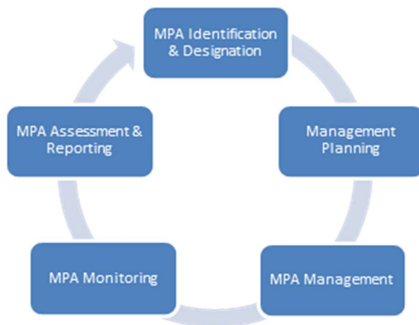
Figure 1: MPA implementation cycle

In order to meet international biodiversity targets, the extent of PCAs on its own is not sufficient: these areas need to be effectively managed in order to achieve sustained outcomes for biodiversity conservation. PCAs must be managed with the primary objective of achieving positive outcomes for biodiversity. Effective management and sustained positive outcomes for biodiversity conservation require clearly defined conservation objectives, the adoption of appropriate management measures and processes, governance systems, adequate and appropriate resourcing, effective mechanisms to promote compliance and enforcement, active stakeholder engagement, and consistent monitoring. It requires consideration of multiple aspects of PAs such as design and planning, inputs, management processes, outputs and biodiversity outcomes. PA management is not intended to be a static activity, instead regular monitoring, review and evaluation should feed back into decision making processes, as set out in Figure 1.