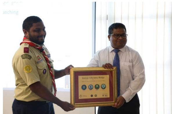
Figure 3: SAM receiving EE Badge

As part of the development of EE badge and while celebrating the environment day, the Ministry launched an art competition on 05th June 2016. The art competition was targeted for students under the four age categories corresponding with the four membership categories of MGGA and SAM. The best art works from each of the four categories was used to derive the design of the EE badge for the respective age category of guides and