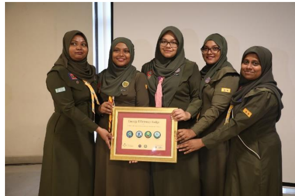
Figure 2: Leaders of MGGA

awareness badge focused on climate change and energy efficiency for all age groups of Girl Guides and Scouts of Maldives.