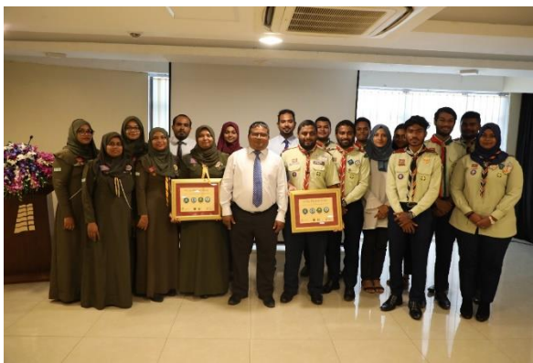
Figure 1: MGGA and SAM members at the EE Badge Launching Ceremony

The Energy Efficiency Badge is designed to create awareness about adverse impacts of climate change, the benefits of energy efficiency in combating climate change, and the benefits of energy efficiency at the national and individual levels.