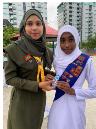
Figure 6: A member of Little Maid receiving the energy efficiency badge

So far, 266 little maids from across the Maldives have attained energy efficiency badge. The outreach of this activity is estimated to be more than 10,000 members of Girl Guides and Scouts and it would have a ripple effect in passing the knowledge from the Girl Guides and Scouts to the community. The Maldives Girl Guides Association and Scout Association of Maldives comprise of members of a range of age groups from preschoolers to professionals in different parts of Maldives.