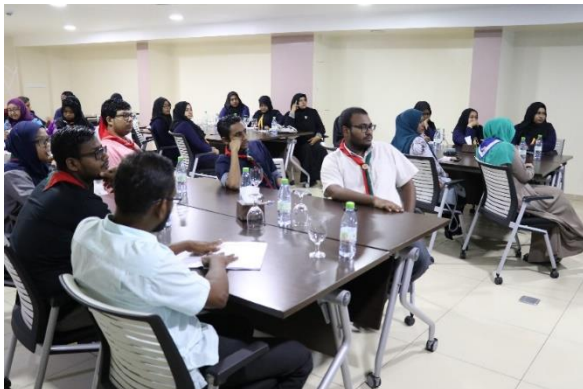
Figure 4: Trainings of leaders of MGGA and SAM

The winners of the Energy Efficiency Art Competition 2016 and the designs nominated to derive the designs of the badge was selected by a judging panel comprising of a technical expert from the Ministry and members from United Artists of Maldives. The winners were announced on 27th February 2017 at a special function organized by the Ministry.