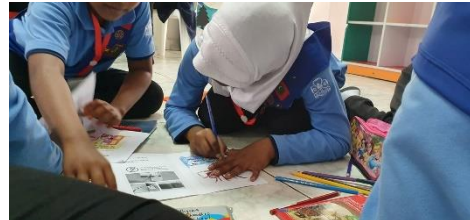
Figure 5: Little Maids doing activities of the energy efficiency badge

conducted for 36 leaders of both associations as a training of trainers to enable the leaders of the associations to carry out further trainings and badge activities among their leaders and members.